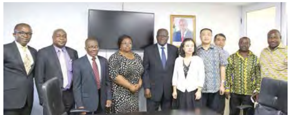
The Chinese delegation in a pose with the VRA team

the Atuabo Gas Processing Plant and was impressed with work being done.