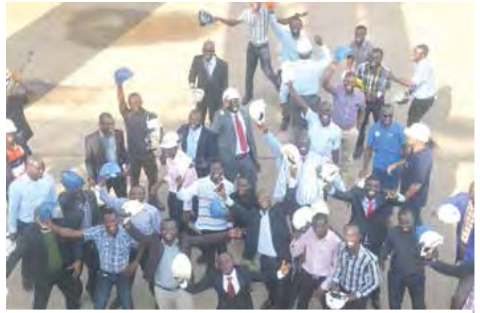
Engineers and technicians celebrating their achievement

Again, contrary to what some people including some government officials would want others to believe, that Volta River Authority (VRA) Engineers receive fat salaries for little or no work done, a team of Mechanical Engineers/Technician, using ingenuity early this year, has achieved a feat which has increased generation by as much as 45 MW.