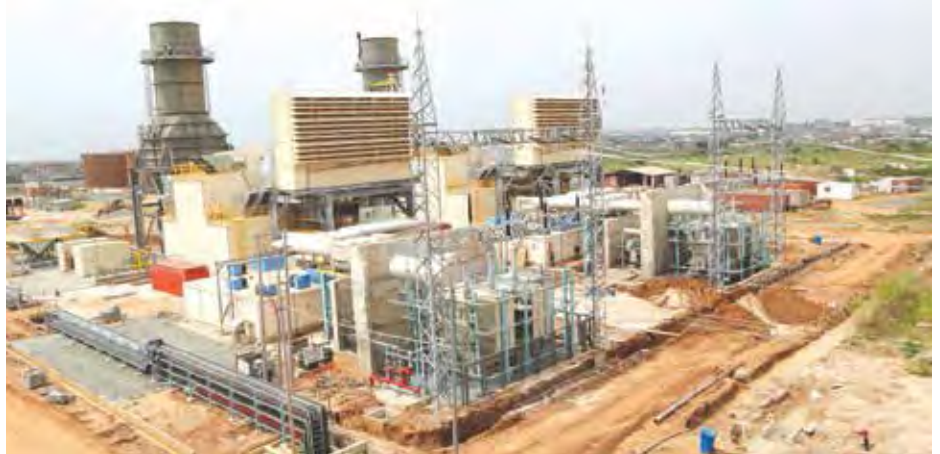
An Aerial view of the Kpone Thermal Power Plant