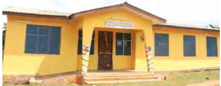
The Pese Community Library

He used the occasion to advise parents within the community to ensure their wards take up the challenge of making the best out of opportunities.