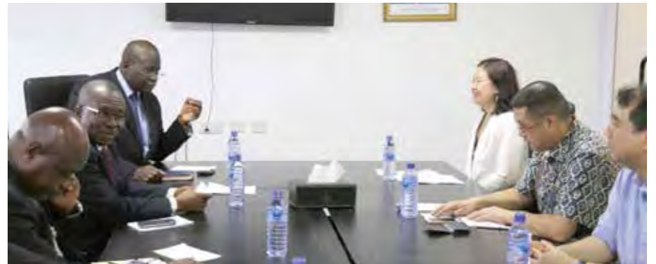
Chief Executive explaining a point to Chinese delegation