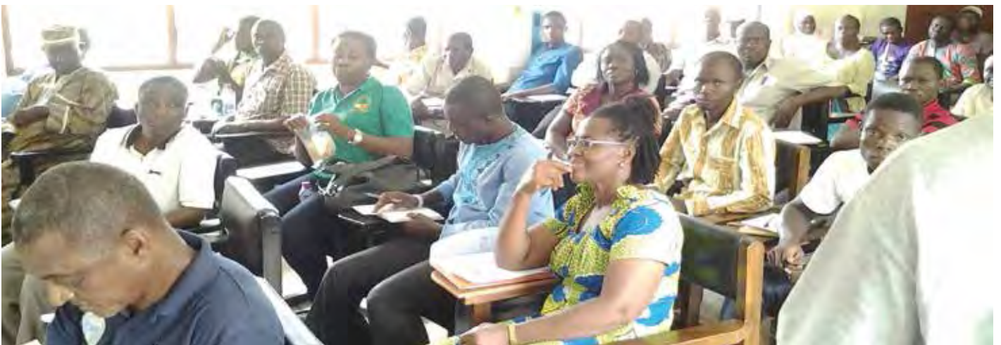
Fish farmers and regulators at the workshop