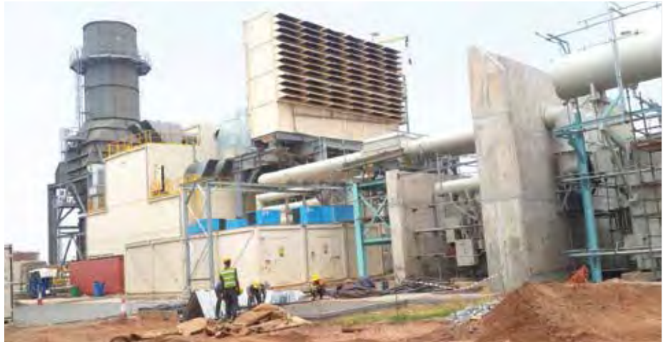
On-going KTPP Project