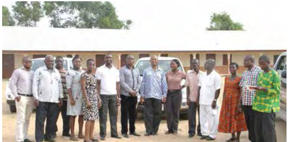
VRA and Keta Municipal Assembly officials at one of the unmarked Safe Havens